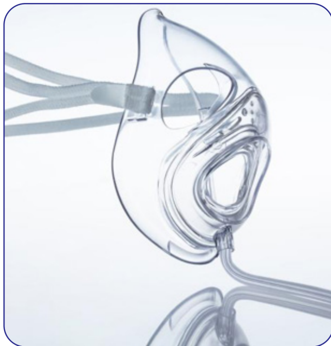
Vyair AirLife™ Open Mask

Open oxygen masks have gained popularity due to their ability to deliver a consistent and reliable \text{FiO}_2 at various flow rates with improved patient comfort, reduced rebreathing of carbon dioxide, and reduced hospital costs. Specifically, these devices can be used at a flow of 1–15 L/min to deliver 24–90% oxygen and were designed with one or more large openings to help clear carbon dioxide efficiently and prevent rebreathing. Additionally, the large holes were designed to improve activities of daily living by allowing the patient to drink and communicate.